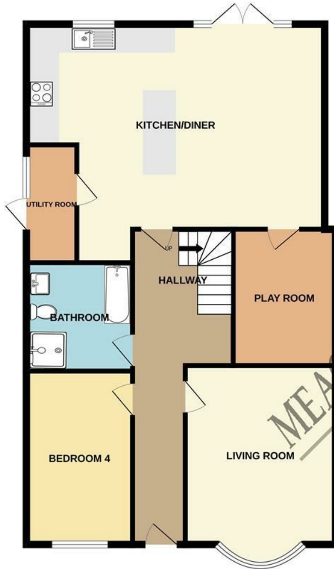
GROUND FLOOR 1008 sq.ft. (93.6 sq.m.) approx.